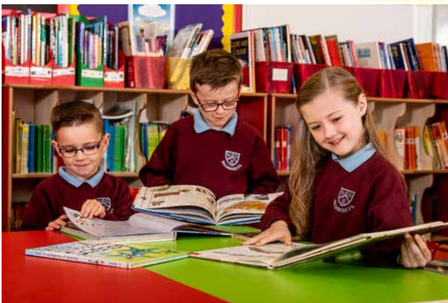
Balnamore Primary School has a dedicated library as well as a resource room where transfer practice papers occur

In Primary 6 we begin the process of preparing our children for the AQE transfer test. We work closely with parents to decide if this is the right path for their child. Children who do not sit the AQE test are fully supported in their learning. We know that every child is different and progresses at a different rate. Our transfer results are extremely good but we also want our children to be confident, well rounded and ready for the challenge of moving to 'big school.'